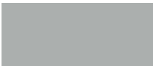
Goosewing Grey 222