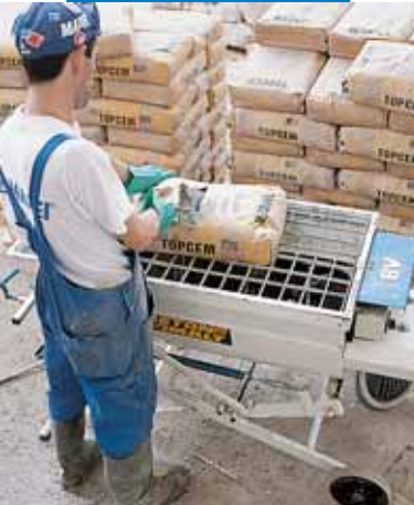
Mixing Topcem in a mini-batcher

Although the technical details and recommendations contained in this data sheet correspond to the best of our knowledge and experience, all the above information must, in every case, be taken as merely indicative and subject to confirmation after long-term practical applications; for this reason, anyone who intends to use the product must ensure beforehand that it is suitable for the envisaged application. In every case, the user alone is fully responsible for any consequences deriving from the use of the product.