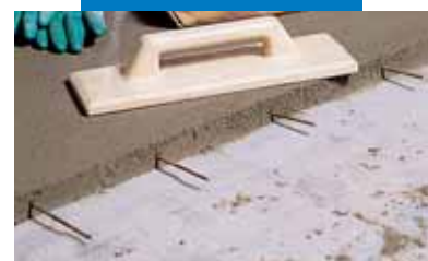
Detail of a Topcem screed with reinforcement rods