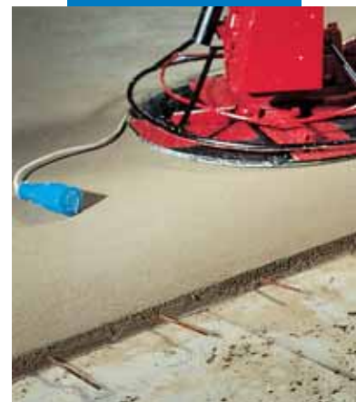
Power floating the surface of a Topcem screed