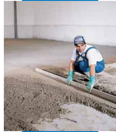
Preparing a levelling strip