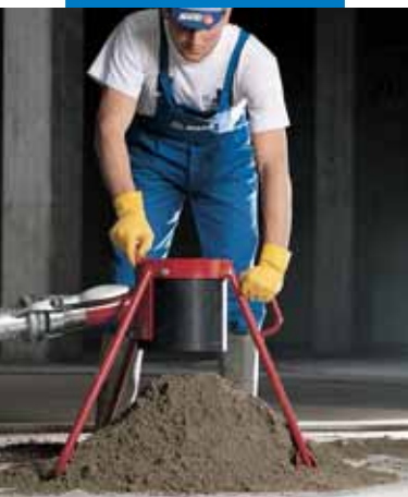
Batching a Topcem mix