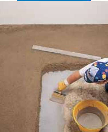
Spreading the anchoring slurry for bonded Topcem screeds