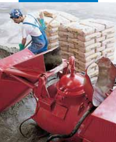
Mixing Topcem with an automatic pumping unit